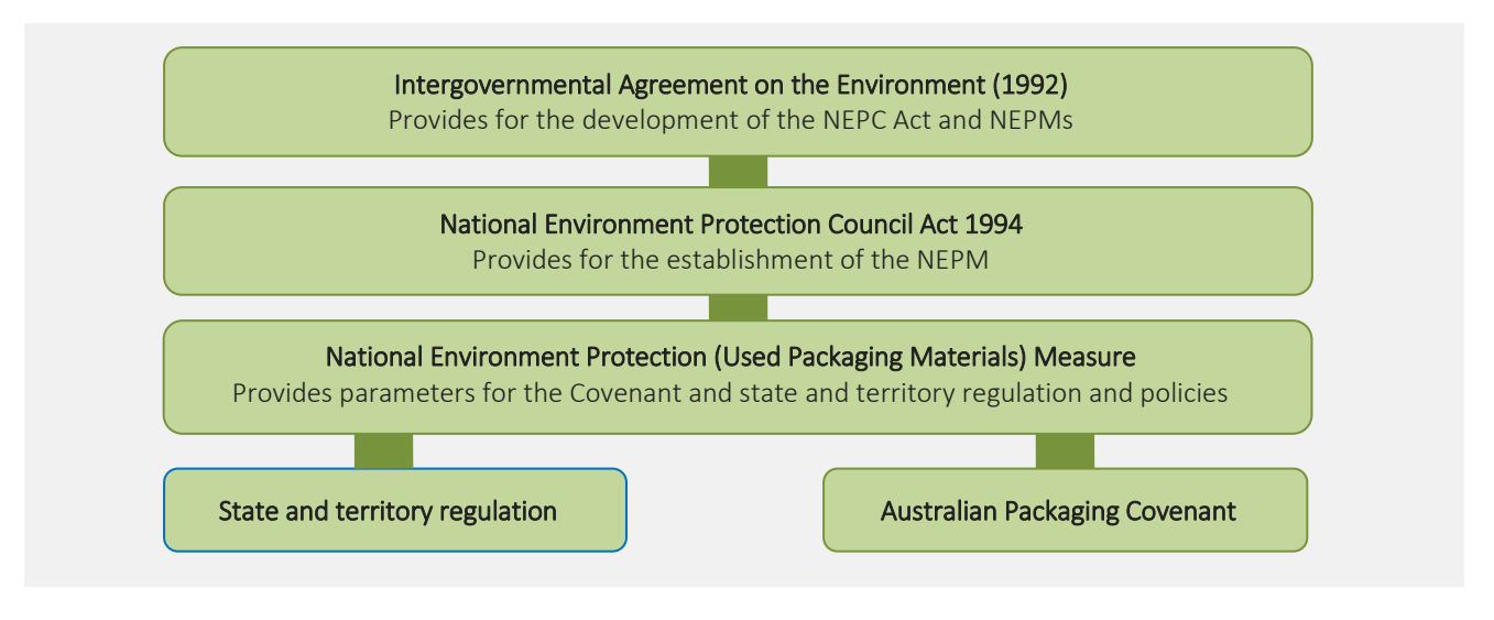
Figure 1 Legislative framework for the Australian Packaging Covenant

The Agreement forms the basis for the development of the National Environment Protection Council Act 1994. This Act contains provisions to enable the National Environment Protection Council, consisting of commonwealth and state and territory environment ministers, to develop National Environment Protection Measures for the re-use and recycling of used materials.<sup>3</sup>